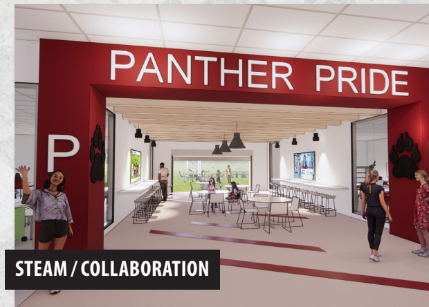
STEAM / COLLABORATION